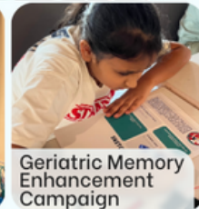
Geriatric Memory Enhancement Campaign