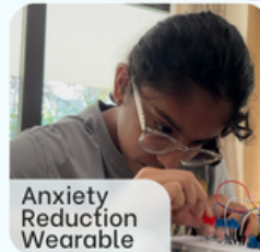
Anxiety Reduction Wearable